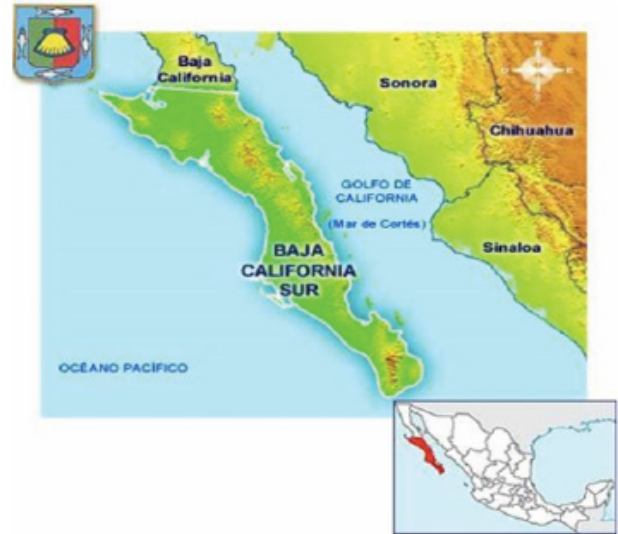
Figure 1. The State of Baja California Sur in Mexico

Introduction. The municipality of La Paz (state of Baja California Sur; Figure 1) has around 292,241 people and receives more than 500,000 visitors annually for work, business, education, health and tourism. 93.6% of the population of La Paz is concentrated in the coastal area, while 4.3 and 2.0%, respectively, are located in the valley and the mountains (Ivanova & Gamez, 2012). The city of La Paz is the capital of the State of Baja California Sur, thus concentrating the majority of governmental, educational and health services. The city area shows a trend of continuous expansion through 2030, as presented in Figure 2.