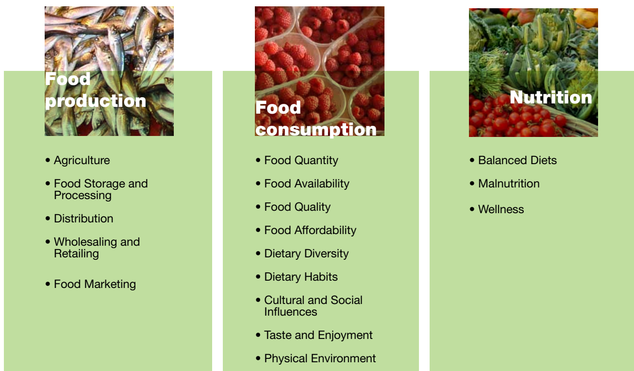
Figure 1: Determinants of the Food System (adapted from Nugent et al., 2011)

There are several landmark papers that have examined the food system from a sustainable lens (Barilla Center, 2010; Foresight Project, 2011; Nugent et al., 2011; Millennium Ecosystem Assessment, 2009; Sustainable Development Commission, 2009). The Sustainable Development