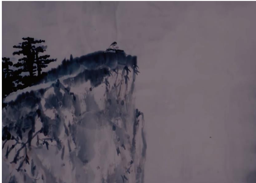
Fig. 4. Still from Feeling from Mountain and Water (14:13). Directed by Te Wei 特偉. Shanghai Animation Film Studio, 1988.

At around 14:13 of the film, the frame moves upwards from the bottom of a cliff, showing the girl on top (Fig. 4). Here, the brushstrokes that constitute the craggy terrain remain watery, but one can still sense the friction between the brush and the expanse of paper. The darker wash on the top of the cliff transitions naturally to the lighter tone farther down—one might even be able to discern the exact point where the brush pushes against the paper and the ink begins to soak through. Though minuscule, the strokes that sketch out the girl's figure share the overall roughness of the landscape.