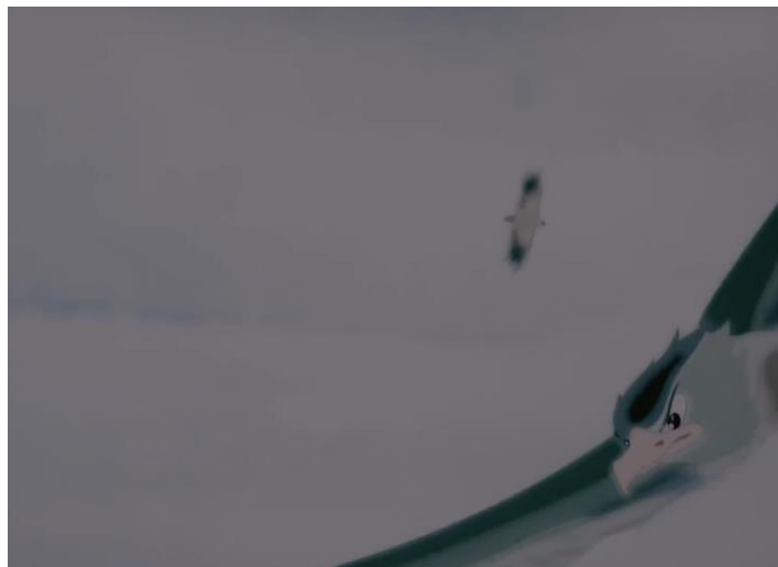
Fig. 8. Still from Feeling from Mountain and Water (08:32). Directed by Te Wei 特偉. Shanghai Animation Film Studio, 1988.

Feeling from Mountain and Water was released when traditional Chinese animation was drawing its last breaths. 32 The “foreign invasion” could be detected even in the utopian world of timeless landscapes. Early on in the film, after his physical health has gotten better, the old man stands on the top of a hill and gazes into the skies. Several eagles are seen circling in the sky. At exactly 08:32, an eagle dives down and skims across the frame (Fig. 8). If one looks closely at the fleeting image, one would recognize that the eagle's eyes appear almost cartoonish, not unlike that of the Disney characters or the big, round eyes in Japanese anime. Indeed, traditional Chinese landscape paintings do not usually feature an extreme close-up of a bird. Without any pictorial precedents to fall back on, designers had, whether consciously or not, resorted to non-Chinese models. Though this close-up could easily be overlooked, it reflected the challenges that the Studio was finding harder and harder to handle.