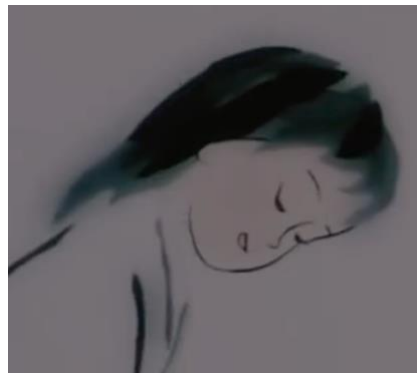
Fig. 6. Detail of Fig. 5.

Granted, the discrepancies mentioned are subtle, but the respective technical processes of the two shots are drastically different. In the production of Feeling from Mountain and Water , animators worked with both paper-based design drafts and cel, transparent celluloid sheets used in traditional animation. For the still landscapes, together with a handful of figural scenes in which the characters are static and less prominent, the animators directly photographed the hand-drawn design drafts done on xuan paper. As for the scenes with significant movement, such as the close-up of the girl playing guqin on a cliff, animators had to go through a process called bimo fenjie 笔墨分解, or the dissection of brushwork. Since celluloid cannot absorb ink, to recreate the subtle gradations of blackness, animators needed to dissect the original drafts into isolated strokes and different shades of ink wash, then redraw each onto a separate layer of cel. 13