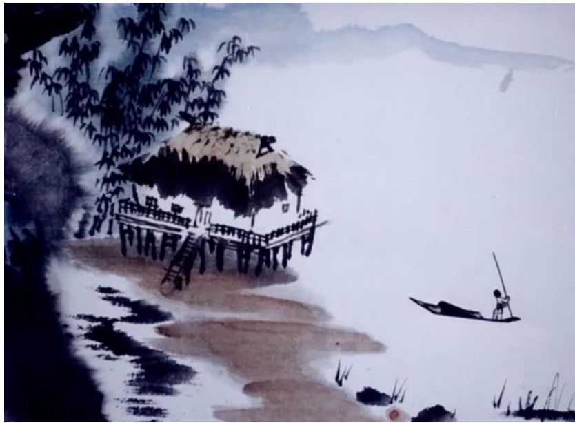
Fig. 1. Still from Feeling from Mountain and Water (03:27). Directed by Te Wei 特偉. Shanghai Animation Film Studio, 1988.

The stylistic ties between Feeling from Mountain and Water and traditional landscape paintings have become the film's defining characteristic. However, the specific strand of landscape paintings by which the film is influenced remains underexamined. As early as the scene in which the girl returns home by boat (Fig. 1), Feeling from Mountain and Water has aligned itself with the visual style of sparse composition and loose brushstrokes. Most of the elements in the shot gravitate to the left half, leaving an unadorned expanse on the right. Hasty, freehand strokes set up the structure of the hut as well as the bamboo grove. The rest of the scenic subjects—from the riverbank, the distant mountain range, to the rock formation in the leftmost foreground—are formed by watery ink wash, instead of being carefully modeled into cragged, tactile surfaces.