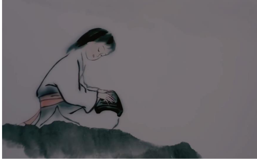
Fig. 5. Still from Feeling from Mountain and Water (14:20). Directed by Te Wei 特偉. Shanghai Animation Film Studio, 1988.