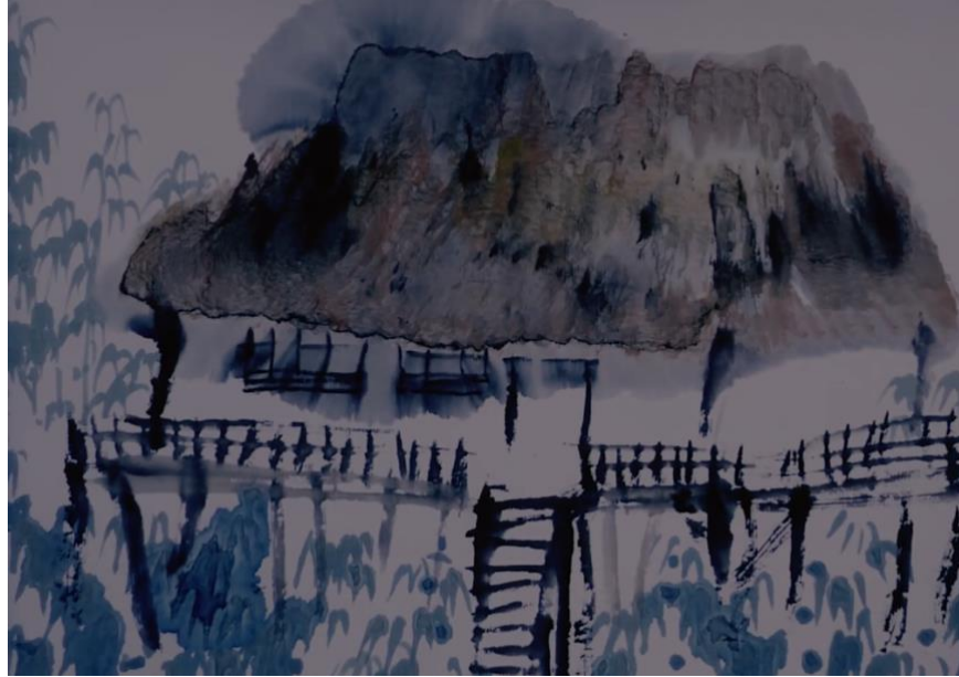
Fig. 2. Still from Feeling from Mountain and Water (03:51). Directed by Te Wei 特偉. Shanghai Animation Film Studio, 1988.

The visual traits of this sequence bring to mind the works of the early Qing painter Shitao 石濤 (1642–1707). Shitao was born amidst the turbulent transition from the Ming to the Qing dynasty, the latter of which led by Manchu conquerors. A descendant of the family of Zhu Yuanzhang 朱元璋 (1368–1399), the first emperor of Ming, Shitao had to spend his early years in Buddhist monasteries to evade Manchu persecution. Growing up, he had been a tireless traveler and prolific painter. His artistic career was defined by his rebellious spirit—he signed his paintings with over thirty different names. 2 When his contemporaries were consumed by the doctrine of “imitating the ancients,” Shitao revolted against such homogeneity and championed the return to selfhood. 3 In his Huayu lu 畫語錄, an essay on the theory of painting, Shitao reminded his readers that there exists a self—the creative expression unique to the artist—besides the ancient models, and that “[one] cannot stick the whiskers of the ancients on [one’s] face.” 4 His art, therefore, is fueled by radical individualism, sometimes presenting itself as a disconcerting oscillation “from the posed and meticulous to the crude and brutal.” 5