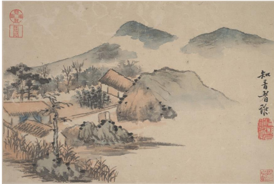
Fig. 3. Landscapes (leaf b). By Shitao (1642–1707), ink and color on paper. 8 1/4 × 12 3/8 in. (21 × 31.4 cm). The Metropolitan Museum of Art, New York.

casual works, notably Leaf B in his Landscapes album 尋僊山水圖冊 (ca. 1690s; Fig. 3). In the album leaf, the composition is sparse. Some dashes of light blue color constitute the faraway mountains, seemingly shrouded by clouds and mist. Amidst the rocky terrain, the small courtyard is sketched with very simple lines and a disregard of perspective. The leftmost shack appears to rest on a tilted ground plane different from the rest of the architecture. The blueness of its curtains overflows, smeared onto its white façade.