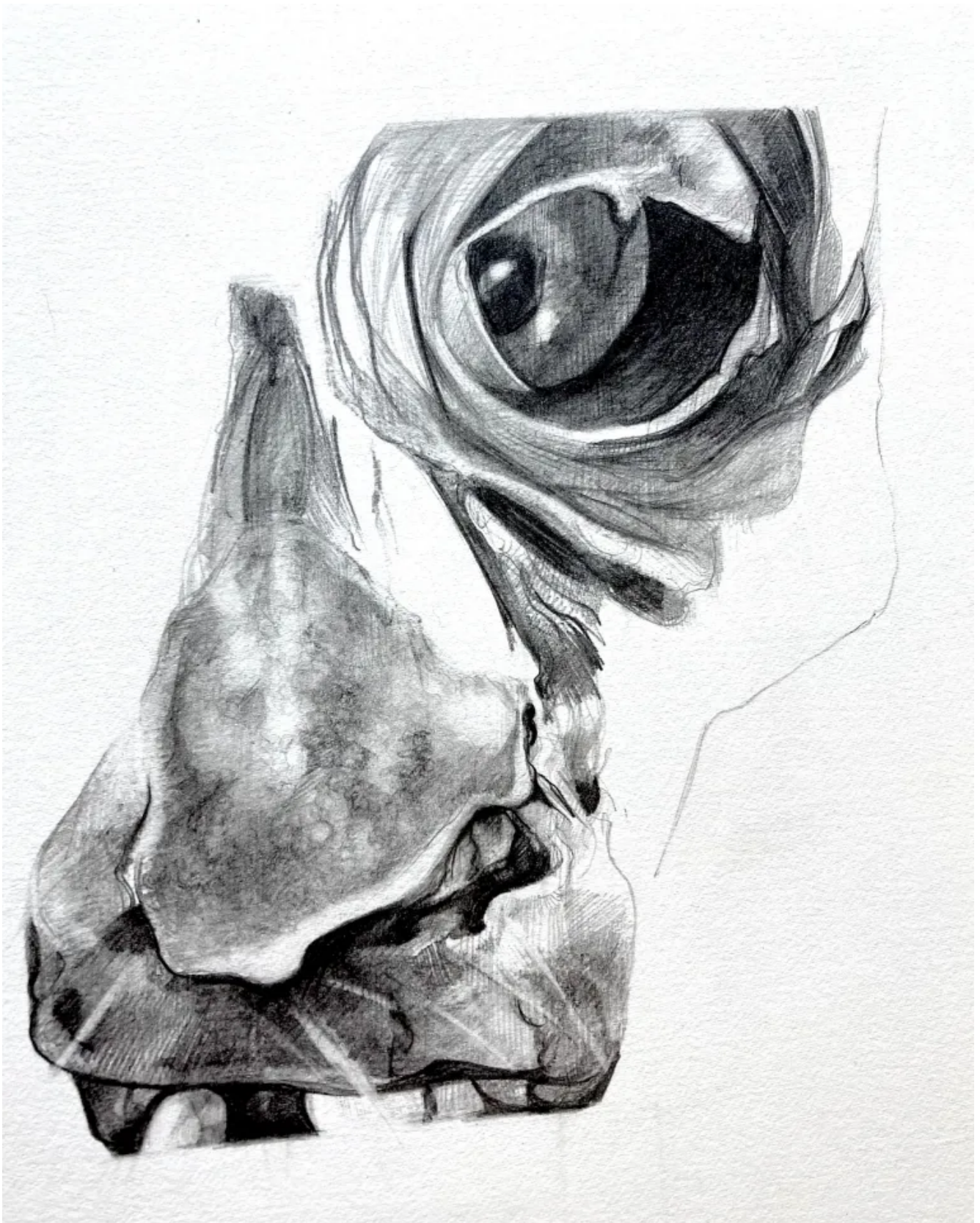
Jac Saorsa, untitled , graphite on paper