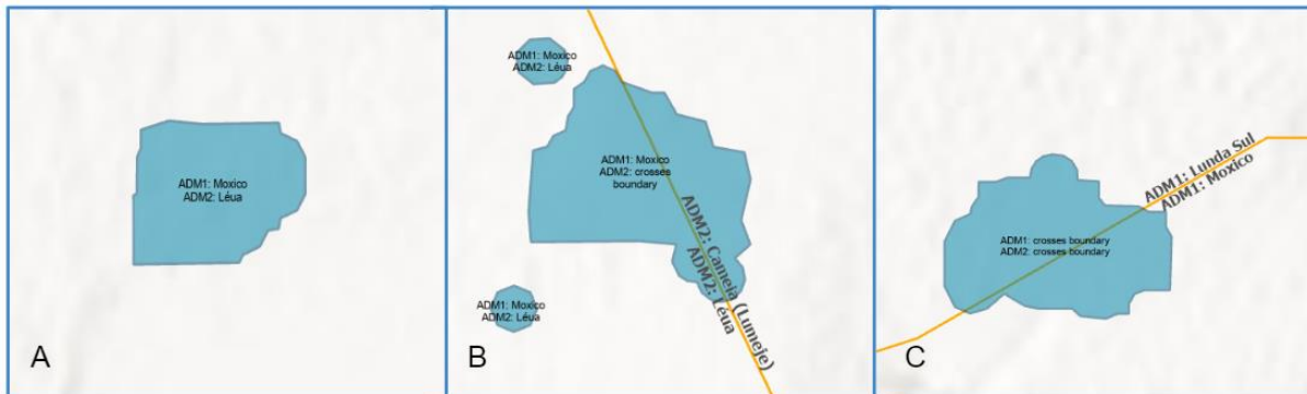
Figure 2: Panel A illustrates the names for both the ADM1 and ADM2 boundaries are provided when a settlement extent resides within a single boundary. Panel B illustrates that only the ADM1 boundary name is provided when a settlement crosses over an ADM2 boundary. Panel C illustrates that neither the ADM1 or ADM2 boundary name is provided when a settlement crosses over an ADM1 boundary.

The administrative boundary names represent the administrative level that the settlement extent resides fully within, down to the second subnational level. If the settlement extent crosses over an administrative boundary then the extent is assigned to the level above and the value “crosses boundary” is used for the administrative boundary name. Settlement PCodes are generated based on the PCode for the administrative level that the boundary resides fully within and a six digit number unique to that administrative level. If an extent falls completely outside of the farthest administrative boundary then, the extent admin level data is set to NA.