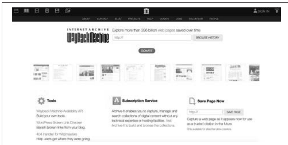
FIGURE 8. Wayback Machine homepage