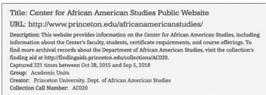
FIGURE 9. Seed metadata including link to finding aid in Description

(i.e., https://archive.org/web , Figure 8). This task tested whether people were aware of the Wayback Machine and how to access it. This was the most difficult task for participants in all groups. Half of them failed, while 4 completed it with difficulty. Only 3 participants easily completed the task.