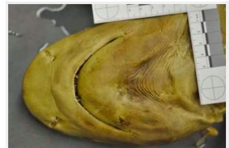
THE BUSINESS END OF S-113

Ever. Anywhere. This single museum collection represents the sum of the world's knowledge about this species being found in these waters. If we did not have this specimen we would have never known that at some point in our past, this species was part of the biological diversity of Kiribati. This fish was collected in 1860, seventy-eight years before the first formal scientific expedition focusing on the Gilbert Islands' fishes. This particular individual had been added to the catalogue during the Louis Agassiz days, and represents an important look back to a particular time and place that no longer exist. Had this collection never been made, had it never been digitized and had the staff there not been willing to answer my emails we would have never known that this species once existed in the waters of the Gilbert Islands.