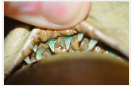
THE TEETH OF SHARKS CONTAIN MANY USEFUL CHARACTERS FOR IDENTIFYING INDIVIDUALS TO SPECIES