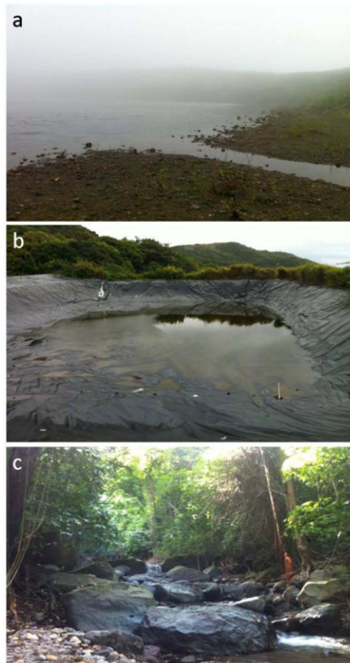
Figure 2. Sample collections sites: (a) a pond; (b) a water dam; and (c) a stream.

Mountain springs are sources of drinking water on the island. Water dams are 110 feet long, 100 feet wide and 12 feet deep reservoirs located in the mountains to collect rainwater that is used by farmers for irrigation (Figure 2). For qPCR, 300 mL water was collected from each site. Each sample received a unique number and was stored at -20\text{ }^{\circ}\text{C} , not more than 48 h, until processed. Additional 300 mL water samples were collected from eight water dams and five mountain springs for culturing of leptospires. Culturing from other samples was not attempted.