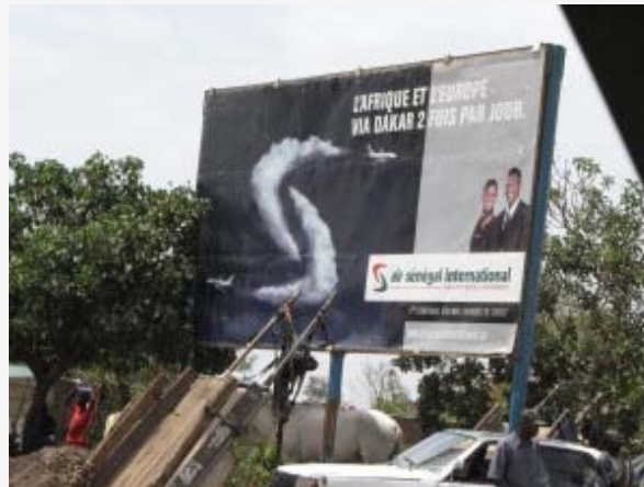
One of many billboards advertising airline travel, Dakar, 2010.

networks. The skillful management of relationships and navigation of networks that make up Dakar's art market offers the promise of movement in many directions and across many spaces for artists and their propositions.