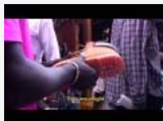
[video] : Businessman 2Pac Colobane checking shoes in Marché Colobane. Video Clip from Market Imaginary .

Just as diligence is fundamental to gaining mobility so too is proficiency in the market's social practices. Knowing how "to operate" in the market involves knowing how to build relationships, maintain them, and of course, navigate the connections they offer. Relationships are important not just for their immediate advantages but also as building blocks or links in potential networks that afford mobility.