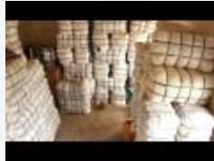
[video] : Bundles of second hand clothing in storeroom. Video Clip from Market Imaginary .

Conceptual elements affiliated with mobility and connectedness (transits, conduits, and circuitries) and the possibilities they promise are deeply embedded in the market imaginary. Objects testify to both the vastness and effectiveness of market circuitries. Visually, materially, and notionally, the presence of objects in the market demonstrates that the outcome of departures and arrivals can indeed be successful. Herein is the articulation of an object's biography, what Appadurai designated as "the social life of things." [5] As much as the market represents the convergence of objects, people, and desires, it is also the point from which these ensembles diverge and take new directions. To look at the piles and arrangements of objects in market stalls is to see them as tentatively positioned, poised for sale and thus departure. Vieux Cissé, a buyer and seller of second hand clothing put it like this, "It is simple. Objects of all kinds arrive here and leave again." [6] For objects so too for people, the market is a place from which to visualize, acquire, and implement various mobilities.