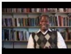
[video] : Economist Ousmane Sene comments on the transportation infrastructure linking Colobane to Dakar, Senegal and West Africa. Video Clip from Market Imaginary .

Along with the type of objects sold at Colobane, the market's geo-spatial location and identity as a transportation hub are fundamental drivers in producing its narratives of place, and as elaborated above, the market imaginary.