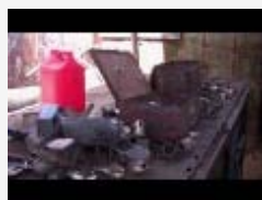
[video] : Tools and spare parts found at Marché Colobane used to repurpose objects. Video Clip from Market Imaginary .

In reference to the designer attire for fashion devotees, the utility value of certain propositions in the second hand market is easily extrapolated. Yet, other used objects in the market seem so broken-down, so depleted, or so worn that one wonders what could become of them? How could they be useful and into what could they be remade or refigured? Marché Colobane's many tables dedicated to the amassment and sale of pièces détachées (spare parts) provide a compelling point of consideration. From a distance, tables piled high with bits and pieces evoke the poignant "heap of broken images" in T.S. Eliot's poem The Waste Land . Some are recognizable spare parts while others are unidentifiable fragments from unknown wholes. Wherever the objects originated, and however they are arranged in the market stall, they are available for remaking, reincorporation, or the reframing of their utility. A "part" by its very definition is constituent; its purpose is to figure into something larger than itself. A place designated for the amassment of "parts" further represents a space from which to consider possibilities for reincorporation into new visual and material arrangements.