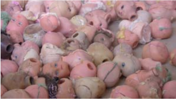
Doll heads in Ndary Lo's studio, 2010.

city that seems to be under continuous construction.