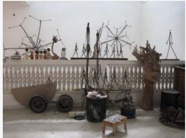
Artworks in Ndary Lo's studio 2010.

Dakar's art market provides the platform and possibilities for travel; it figures as a conduit to other art world sites. The networks and circuitry that make this possible include the many art professionals and amateurs who visit the city to prospect inventory for exhibitions and other projects. Likewise, the many international institutions in Dakar, especially the city's foreign cultural centers and embassies weave Dakar's art market with international circuitry. Institutions such as the British Council, the Institut Français , the Goethe Institute and other international bodies including non-profits and corporations such as Eiffage Sénégal offer regular opportunities for exhibitions, acquisitions, and collaborations. By way of these sites and the individuals associated with them, artists have potential access to many networks and opportunities for mobility.