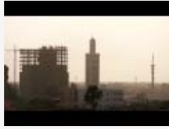
[video] : Dakar's skyline with mosque and construction in progress. Video Clip from Market Imaginary .

of Senegalese to Europe. Markets in general and Marché Colobane specifically offer a point of departure for interpreting this work materially and conceptually. The materials in this mixed media installation are used shoes from Marché Colobane and scaffolding rods visible at the construction sites populating the city's built environment.