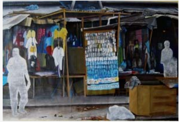
Cheikh Ndiaye, Enfranchissement of Competing Voices , 2011, mixed media on canvas.

Marché Colobane is aptly characterized by the Wolof dictum, " Lepp looy wut rekk am na marsé Colobane (You can find anything in the world at Marché Colobane)." The objects populating market stalls — colorful plastics, used clothing and shoes, new garments and shoes, tattered copies of journals such as Jeune Afrique or Marie Claire , watches, cosmetics, radios and cell phones — oblige the eye and imagination to travel. Attributed to China, France, Nigeria, South Africa, and the United States, the objects points of origin declare association with elsewhere. Their very presence draws lines of connection to places beyond the market's immediate visual register. Even as these objects indicate the expansive commercial relationships webbing Africa, Asia, Europe, and the Americas, they signify the continent's rapid transformation into a consumer society, where objects from all corners of the globe find their way across miles of ocean, settling momentarily in the market. Viewed collectively, their visual power is straightforward: the range of objects and points of origin they invoke visualize the market as a coalescence of multiple circuitries.