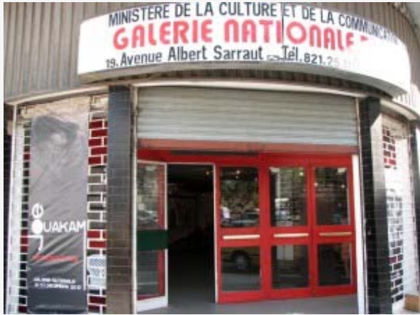
Dakar's National Gallery, 2010.

work in their studios, when they travel, or at their exhibitions. In short, the art market is a most opportunistic phenomenon because transactional possibilities can arise whenever potential buyers and sellers converge. Exhibitions in Dakar do not just serve to display visual propositions; they also represent spaces for potential commercial transaction and social interaction. While Dakar has few dedicated commercial galleries for the sale of art, it does have many exhibition sites, including both the government owned National Gallery and IFAN Gallery as well as the privately owned and operated Musée Boribana and Espace Vema.