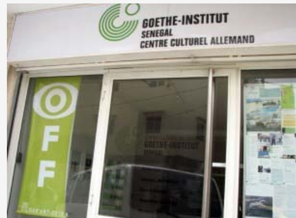
The Goethe Institute during Dak'Art Biennale, 2010.

Unlike Marché Colobane, the art market in Dakar cannot be assigned a single location or geographical center. In Dakar, art market spaces are enmeshed in the city just as they are locatable beyond it. Along with a handful of occasional buyers and dedicated collectors who live in Dakar, a steady flow of buyers come to the city, acquire art and take off again. Commercial encounters between artists and buyers are what constitute market spaces. Thus, instead of describing its topography in terms of brick and mortar constructions, the art market in Dakar is best characterized as fluid, contingent, and in a state of continuous re-composition. Those entering and exiting the market come from diverse directions and positions, and so link Dakar's art market to a constellation of transnational sites. The ins and outs of those who buy art and collect its stories not only impart great mutability to the art market, they also lace the art market with many networks for artists to access and navigate.