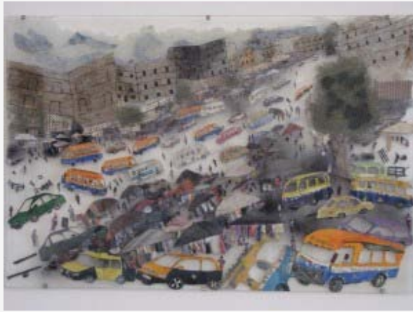
Fally Sene Sow, Rocade Colobane , 2010, mixed media collage and glass.

a place where one "can find anything in the world," including stolen merchandise and illicit commerce. Anecdotes about finding a misplaced or stolen wallet, watch, or passport at Marché Colobane abound. Along these same lines, many speak with derision or frustration about the neighborhood as a slum whose monstrous traffic jams and intractable