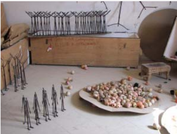
Materials and art works in Ndary Lo's studio, 2010.

The association of markets with mobility figures prominently in my analysis of artists and institutions in Dakar. As illustrated in the preceding discussion of Marché Colobane, the art market is a site where mobility can be visualized, articulated, and actualized. The impressive number of artists in Dakar who travel for work further indicates that markets, and in this case the art market in particular, provide the conditions of possibility for movement. Whether in subtle increments or radical leaps, artists and their works move because of the circuitries and networks of Dakar's art market. Despite the frequent complexities of obtaining the right visa and acknowledgement that art objects often move with greater ease than their makers, examination of artists' career trajectories points out that the market generates many opportunities for mobility and that market related opportunities produce artists' careers.