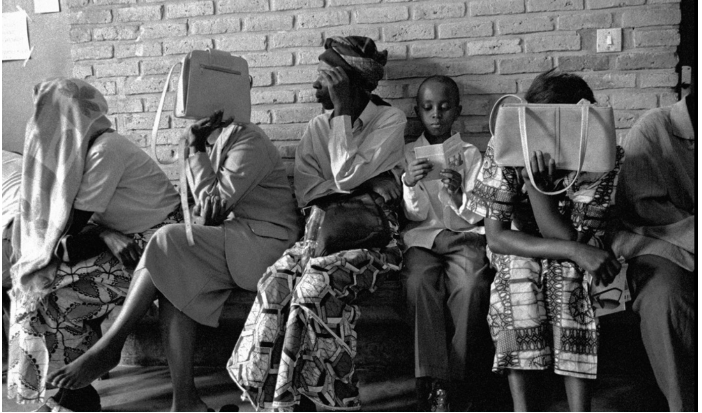
Women attending an HIV clinic in Rwanda avoid the camera.