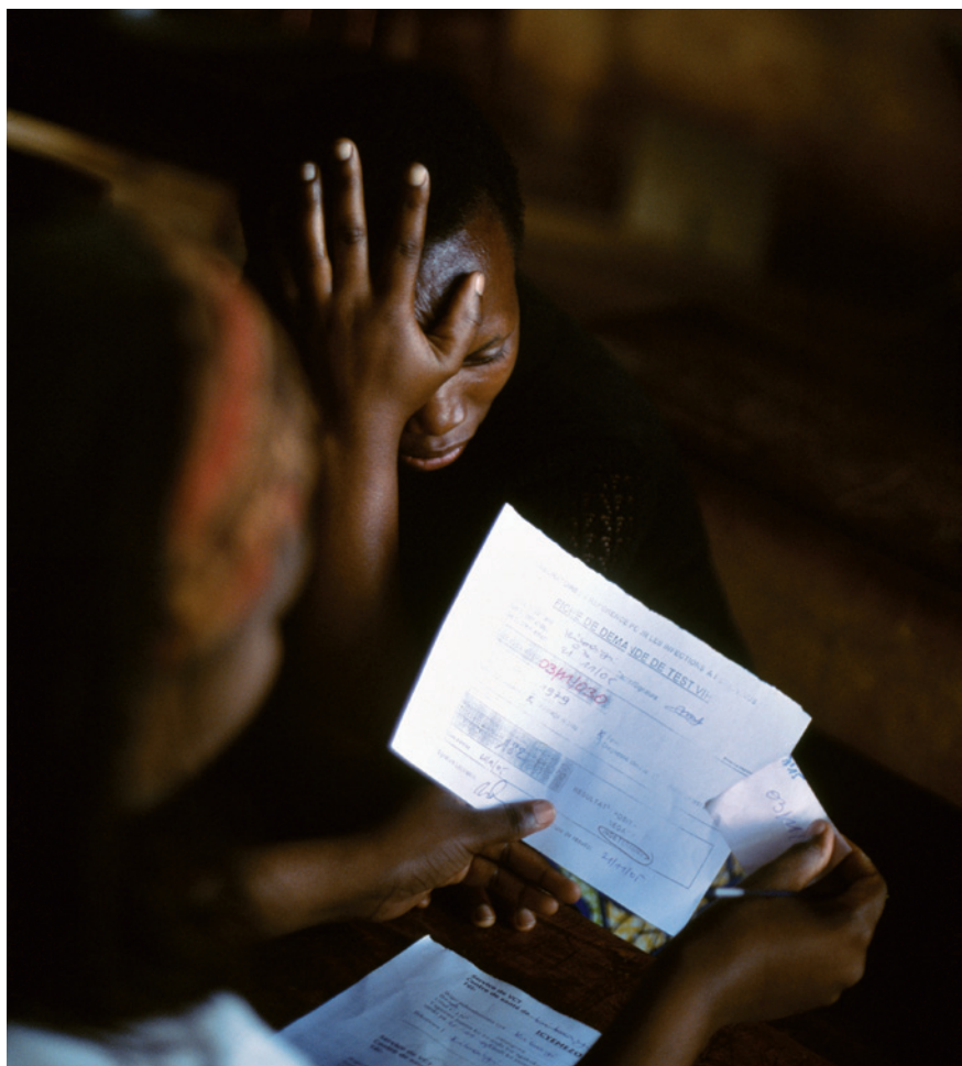
A woman receiving her AIDS test result at Kibayi Health Centre in Rwanda.