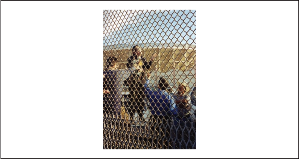
Figure 5. Posadas Without Borders in Tijuana–San Diego, looking toward Tijuana (Mexico) Photo courtesy: Isidro Cerda, December 2007.