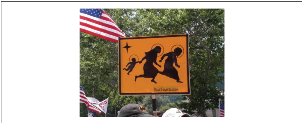
Figure 2. The traditional immigrant crossing sign reinterpreted as the Holy Family in pro-immigrant march

places along the U.S.–Mexico border, in protest and despite its fortification (Hondagneu-Sotelo et al., 2004; Hondagneu-Sotelo et al., 2007). 1