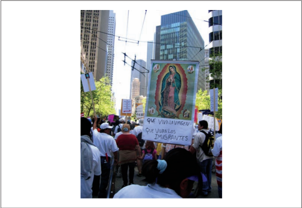
Figure 1. “Viva the Virgin and the immigrants!” sign in pro-immigrant march in San Francisco, California Photo courtesy: Gabriel Fumero, May 2006.