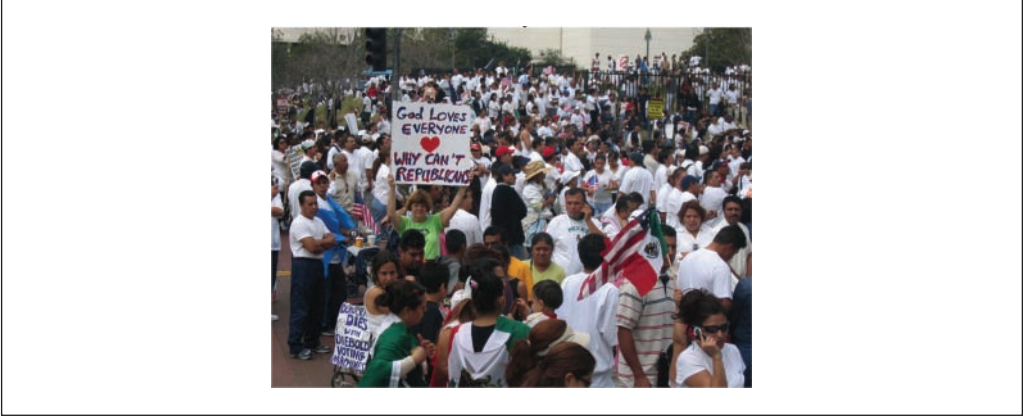
Figure 3. “God loves everyone. Why can’t Republicans?” sign in pro-immigrant march in Los Angeles, California

Photo courtesy: Gabriel Fumero, May 2006.