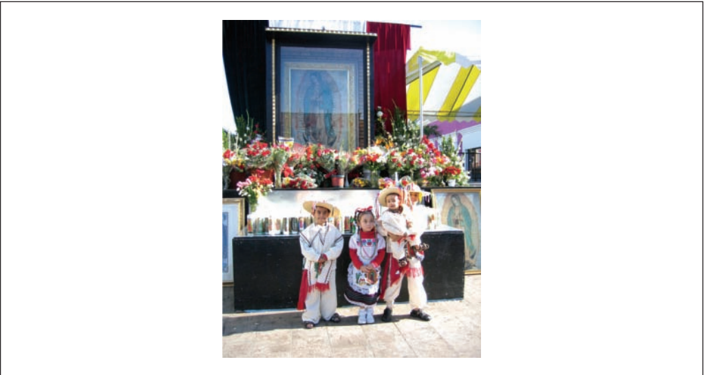
Figure 4. Children dressed in traditional costumes for the festivity of Virgin of Guadalupe in Plaza Mexico shopping mall, Lynwood, California

Photo courtesy: Gabriel Fumero, May 2006.