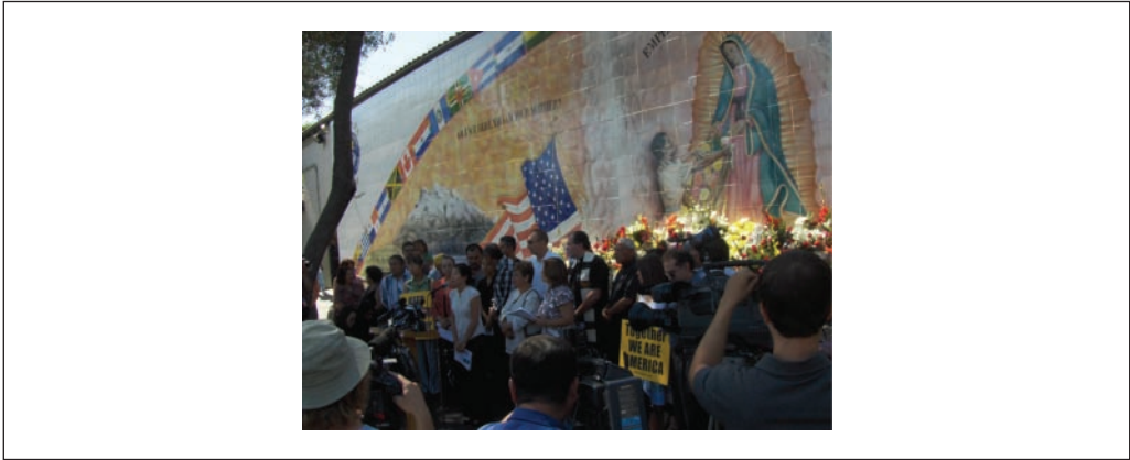
Figure 7. Coalitional announcement for the inauguration of the New Sanctuary Movement in Los Angeles, Plaza Olvera

Photo courtesy: Grace Dyrness, January 2007.