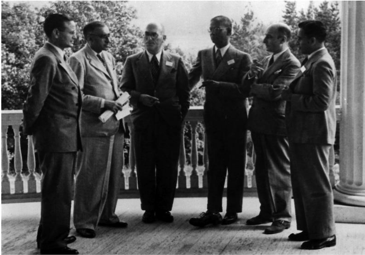
United Nations Monetary and Financial Conference (Bretton Woods, New Hampshire), July 1-22 1944