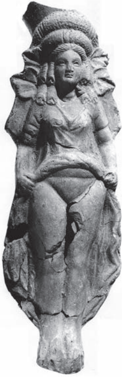
Figure 1 (left). Figurine from the public baths at Tell Atrib, Ptolemaic Period (3rd-2nd centuries BC). Reproduced from Mysliwiec 1994b: tafel III, with the kind permission of Prof. Mysliwiec.