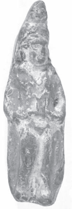
Figure 2 (right). Figurine from a household context at Karanis, Roman Period—KM6488 (Late 2nd-early 4th century AD).

ally managed to recover their beloved and to save him or her, at least partially, from eternal death. In both Egypt and Greece, these myths served as an explanation for the change of seasons and as a model for the eventual death and spiritual rebirth of their worshippers. Indeed, the creative melding of these cults is virtually the only way to explain the strange “Byblos” portion of Isis’ travels, as told by Plutarch. 69 According to his narrative, Isis’ search for Osiris led her to Byblos, where like Demeter she disguised herself as a mortal and sat down by a watersource, dejected and tearful, until she managed to enter the service of a wealthy household as a nursemaid. Both goddesses attempted to confer immortality to their charges but abandoned the project when the mother’s scream of horror interrupted the child’s apotheosis by flame. So, certainly, in this case at least, part of Demeter’s tale had been incorporated into Isis’ own life story.