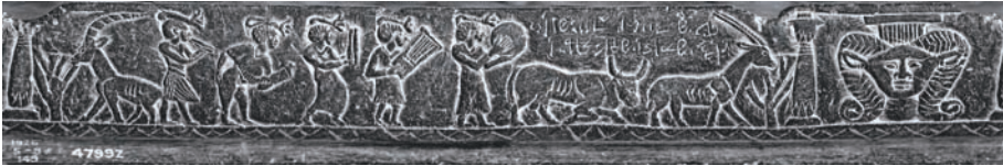
Figure 3. Bowl depicting a festive procession, Persian Period (c. 500-525 BC).

Before leaving the terracotta figurines depicting anasyrmenê , however, I want to explore one more notion—namely that such figurines were part of a concerted effort in Greco-Roman Egypt to promote cultic festivals. Such figurines, mass produced in workshops such as those found at Tell Atrib, may have earned extra income (and advertisement) for the local festivals at which they were sold. For those who bought them, on the other hand, the terracottas may have served not only as souvenirs, but also as the distillation of the essence of the festival itself. As David Frankfurter puts it, “Placed in a domestic space, an altar, a niche—these figures would bring the temple’s procession and all it signified into a state of accessibility, a miniaturization that would articulate the relationship between domestic altar and temple altar throughout and beyond the festival.” 76