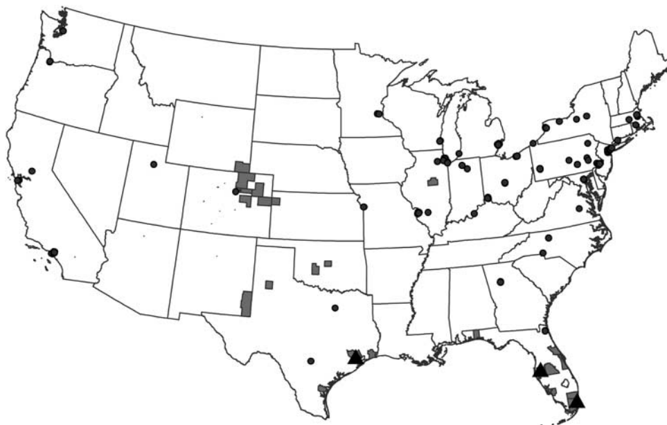
Former Lead Smelting Sites at High (Triangles) and Low (Circles) Risk for Tornado Exposure.

Tornado high-risk areas are shaded. Overlapping location markers indicate multiple sites within the same city.