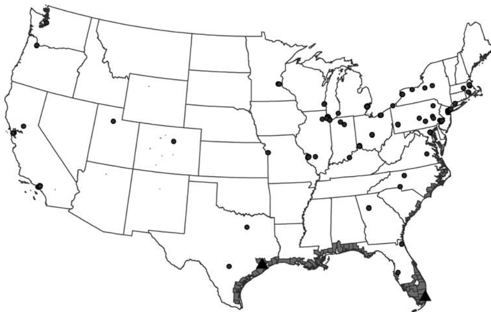
Former Lead Smelting Sites at High (Triangles) and Low (Circles) Risk for Hurricane Exposure.

Hurricane high-risk areas are shaded. Overlapping location markers indicate multiple sites within the same city.