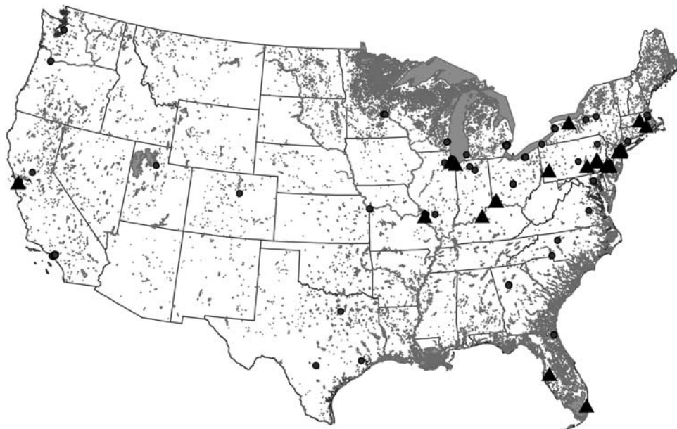
Former Lead Smelting Sites at High (Triangles) and Low (Circles) Risk for Flooding Nationally.

Flood zones are shaded. Overlapping location markers indicate multiple sites within the same city.