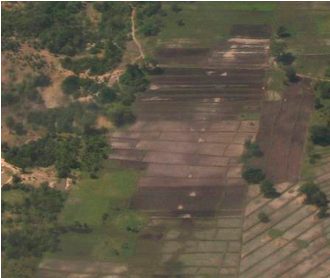
Figure 3. Aerial photograph of rice paddies after harvest in Tanzania. Difference in soil color in the middle of the fields is indicative of variation in soil nutrient availability within rice paddies, which is caused by the movement of biomass to the middle of the field during threshing.

Biomass removal is a common practice in smallholder systems where weeds and crop residues are uprooted from the farm field and tossed to the field edges. Relocation of this biomass translates to relocation of valuable nutrients and organic matter to the field edges and nutrient mining in the middle of the farm fields. In contrast, rice threshing often occurs in the middle of the drained paddy, which concentrates nutrients (mainly K) in the center of the field (Figure 3).