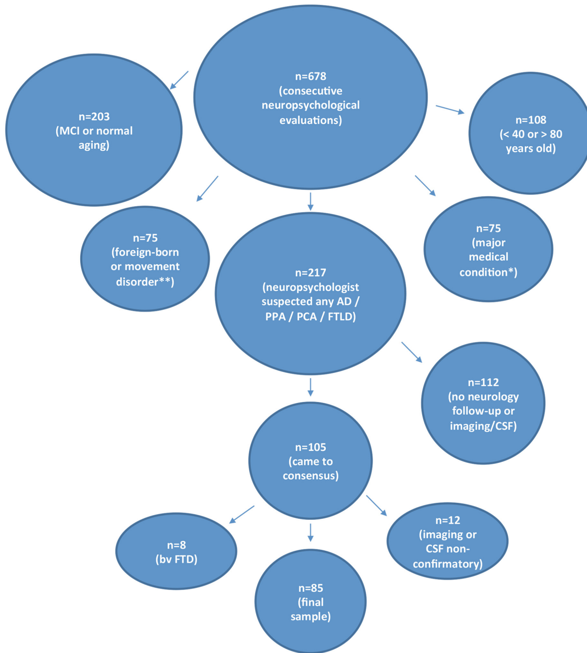
Fig 1. Study Flow Chart with Inclusion and Exclusion Criteria. *e.g., cancer, heart surgery, traumatic brain injury, brain tumor, multiple sclerosis, stroke (as documented by evaluating neuropsychologist). **e.g., myoclonus, dystonia, parkinsonism.