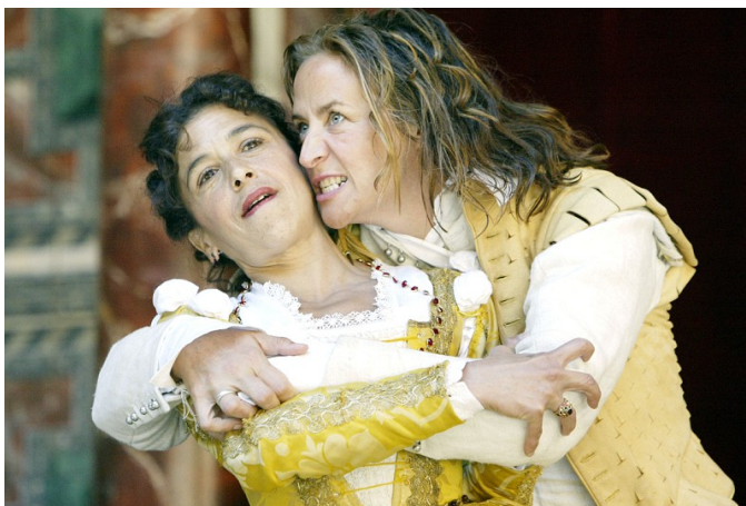
Katherine (Kathryn Hunter) and Petruchio (Janet McTeer): Lloyd, Shakespeare's Globe, 2003.