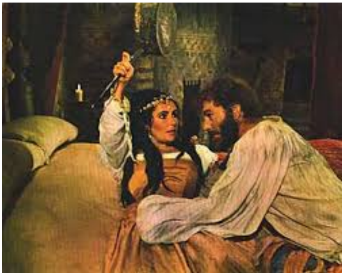
Katherine (Taylor) and Petruchio (Burton) go to bed: Zeffirelli, 1967.