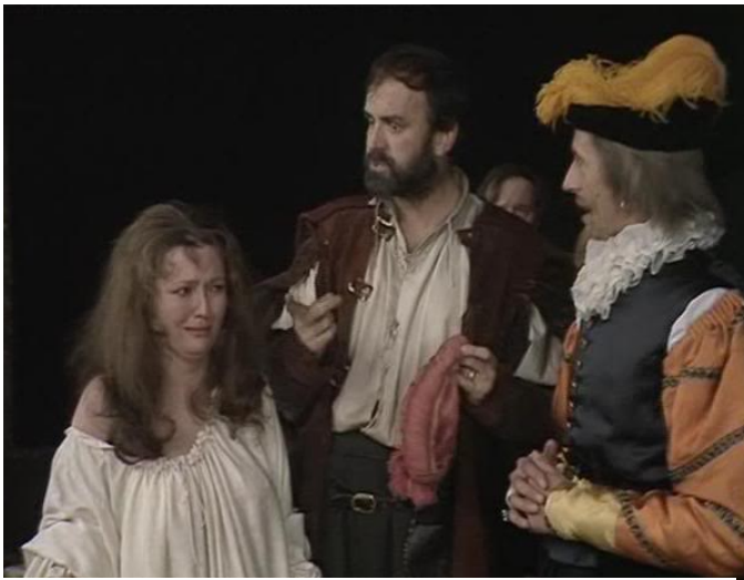
Katherine (Badel), Petruchio (Cleese), and Hortensio (Jonathan Cecil) arrive home: Miller, BBC, 1980.