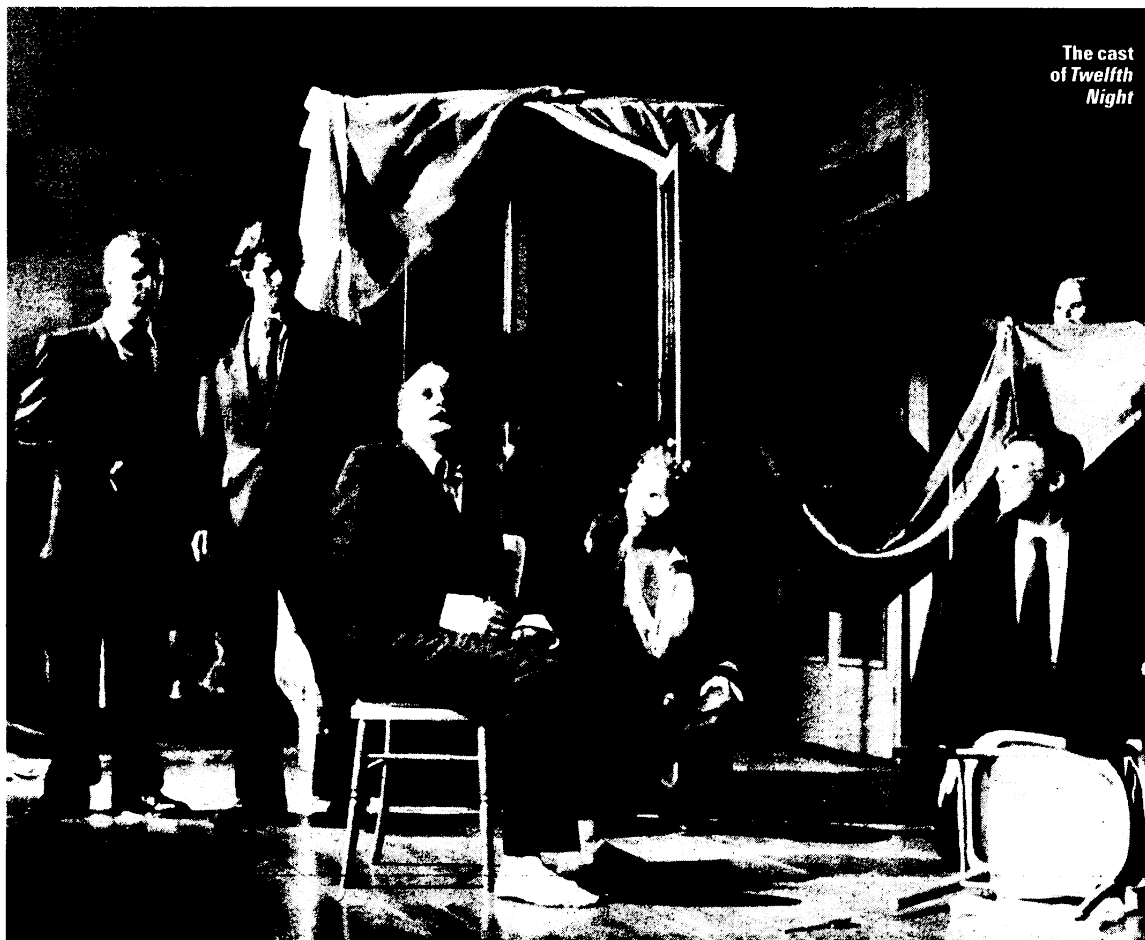
The cast of Twelfth Night