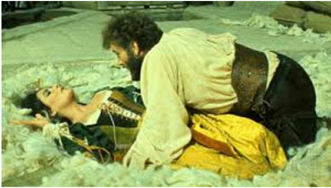
Katherine (Elizabeth Taylor) meets Petruchio (Richard Burton): Zeffirelli, 1967.