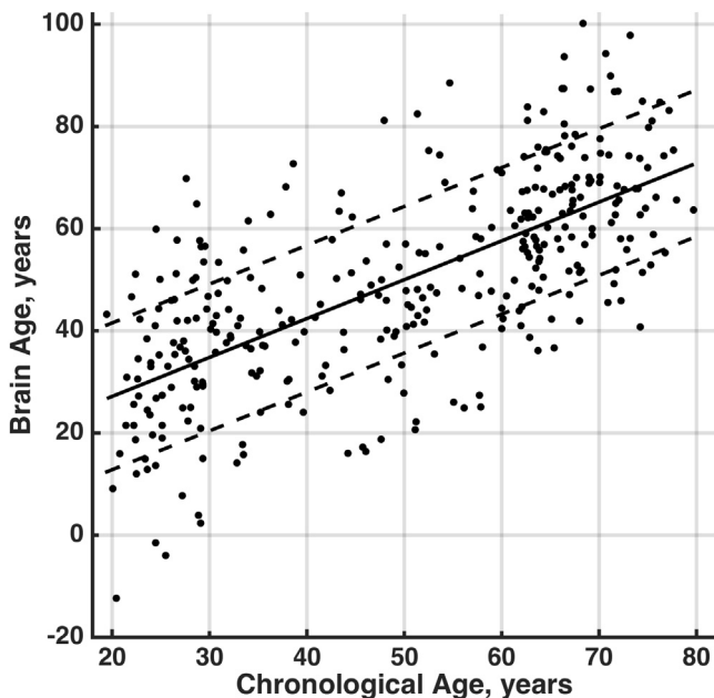
Fig. 1. Scatter plot of chronological age versus brain age in years after adjusting for nuisance variables. The solid line is the regression fit between the 2 variables, and the dashed lines are 1 standard deviation away from the regression fit.

Education and MET scores for each of the 9 physical activities were regressed against the difference between CA-BA. The overall F-test was significant for this model ( F(10, 320) = 2.14 , p = 0.021 ). CA-BA was significantly related to education ( B = 0.95 , t(320) = 2.84 , p = 0.0048 ) and FOSC ( B = 0.58 , t(320) = 2.84 , p = 0.0048 ). All other measures were nonsignificant as follows: walking/hiking ( B = 0.041 , t(320) = 0.40 , p = 0.69 ), jogging ( B = 0.16 , t(320) = 1.32 , p = 0.19 ), running ( B = -0.042 , t(320) = -0.36 , p = 0.72 ), bicycling ( B = 0.055 , t(320) = 0.56 , p = 0.57 ), aerobic exercise ( B = -0.063 , t(320) = -0.82 , p = 0.41 ), lap swimming ( B = -0.072 , t(320) = -0.55 , p = 0.58 ), tennis/squash/racquetball ( B = 0.004 , t(320) = 0.027 , p = 0.98 ), and low intensity exercise ( B = -0.031 ,