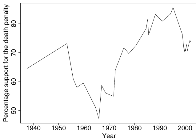
FIG. 1. The proportion of adults surveyed who answered yes in the Gallup Poll to the question, “Are you in favor of the death penalty for a person convicted of murder?” among those who expressed an opinion on the question. It would be interesting to estimate these trends in individual states.

divided by the proportion who will support the Republican; it is straightforward to move from estimating a population mean to estimating this ratio, as discussed in the context of this example by Park, Gelman and Bafumi (2004)]. We would also like to use series of national polls to estimate state-by-state time trends, for example in the support for the death penalty over the past few decades. (See Figure 1 for the national trends.)