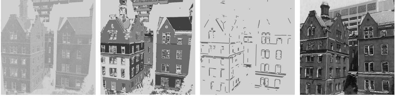
Figure 2: a) Range data scan, b) Planar Segmentation (different planes correspond to different colors), c) Extracted 3D lines generated from the intersection of planar regions, d) 3-D lines projected on the image after registration.

at least two line matches are given. The minimization of the error function \sum \|\mathbf{n}_i' - R\mathbf{n}_i\|^2 (where \mathbf{n}_i', \mathbf{n}_i is the i th pair of matched line orientations between the two coordinate systems) leads to a closed form solution of the rotation (expressed as a quaternion) [7].