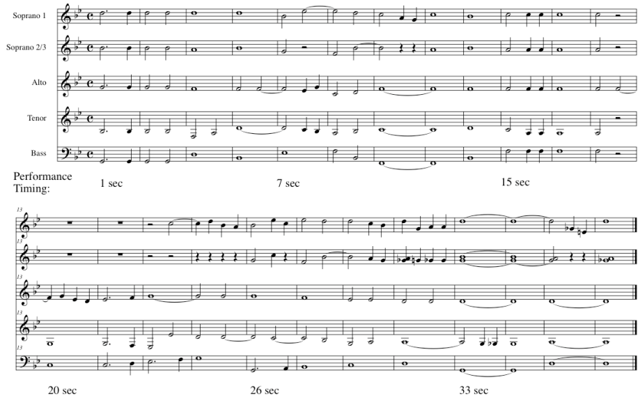
Figure 2. Opening of Allegri's Miserere .