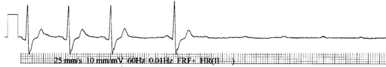
Fig. 2. Rhythm strip (lead II) of a heart transplant patient with complete heart block with ventricular asystole, recorded 20 seconds after atropine was administered during dobutamine stress echocardiography.