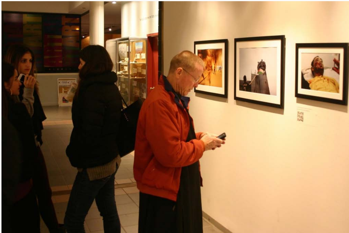
A visitor to “From These Streets” enters the URL to listen to an audio caption on the night of the opening, Nov. 6, 2013.

According to Ariella Azoulay’s analysis in The Civil Contract of Photography , an important set of connections is formed simply by viewing a photograph. Her concept of a “civil contract” within photographic practice “is an attempt to anchor spectatorship in civic duty toward the photographed persons.” [1] She explains the distinctiveness of this relation, thusly: