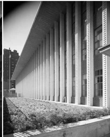
Figure 6.1.3: P.S. 199 Jessie Isador Straus School, Manhattan, NY Photographed by Ezra Stoller, 1964 Image Courtesy of Ezra Stoller Archive (Esto)

During window replacement at P.S. 199M in 2008, the community first learned that caulk surrounding the window may have contained PCBs; however, the windows were still removed and the caulk replaced without an abatement plan or precaution in terms of protecting the soil.