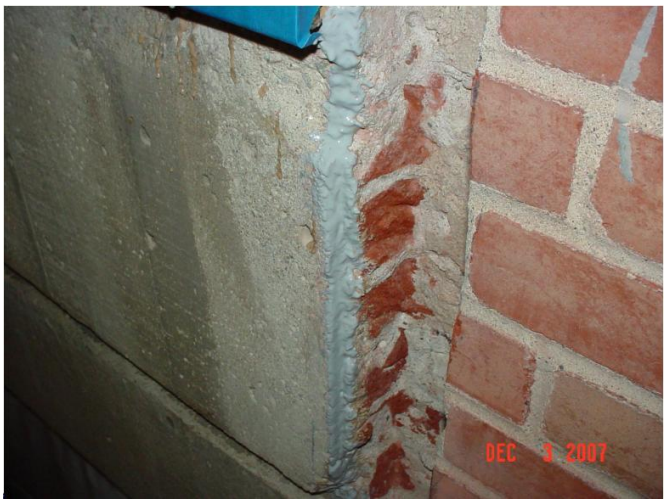
Figure 6.2.7: Westgate Silicone Encapsulation Detail Cambridge, MA