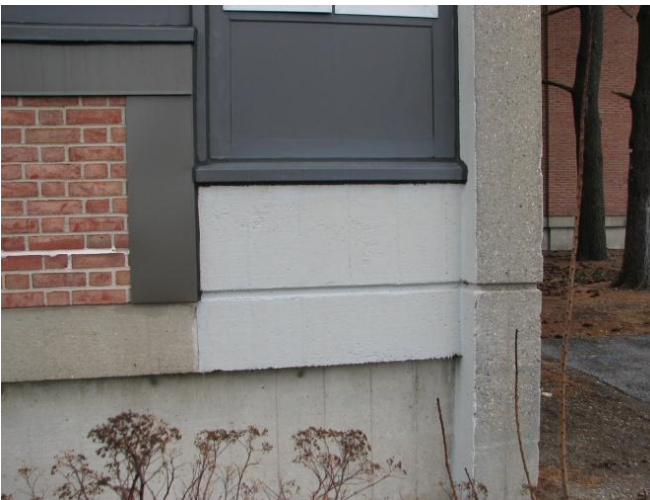
Figure 6.2.6: Westgate Encapsulation Detail Cambridge, MA Photographed by Emily Sinitski, 2013