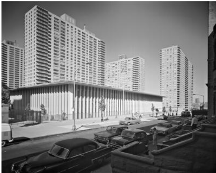
Figure 6.1.2: P.S. 199 Jessie Isador Straus School Manhattan, NY Photographed by Ezra Stoller, 1964 Image Courtesy of Ezra Stoller Archive (Esto)

Case study one, P.S. 199M or the Jessie Isador Straus School was designed by noteworthy architect Edward Durell Stone in 1963 (See figures 6.1.1 and 6.1.2 for images from 1964). It is located on the Upper West Side at West 70 th and houses students from kindergarten to 5 th grade. The buildings' white brick piers wrap around the exterior of the building, reminiscent of a Classical colonnade. Protruding brick headers on the piers give texture to the linear façade. The dark windows and bricks between these columns contrast the white columns emphasizing the depth. The building is topped with a concrete slab. Stone's attention to detail is showcased on the underside of the roof's overhang which has a concentric square pattern. These character-defining features remain on the building. Therefore, the Jessie Isador Straus School has maintained a high level of historic integrity. Even the replacement windows closely match those of the original design.