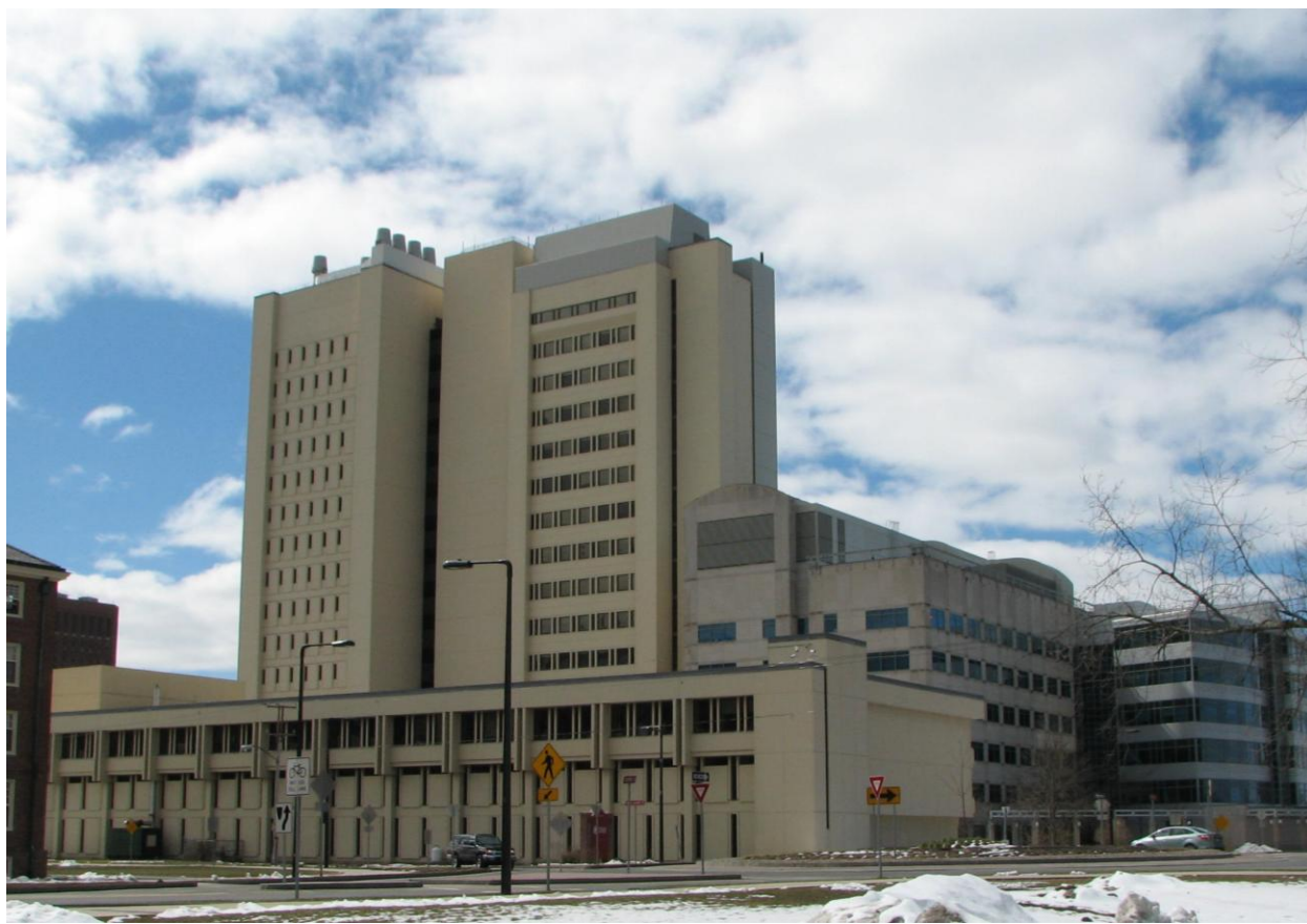
Figure 6.3.1: Lederle Graduate Research Center, Amherst, MA