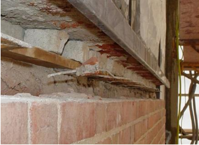
Figure 6.2.4: Westgate Brick Removal Cambridge, MA