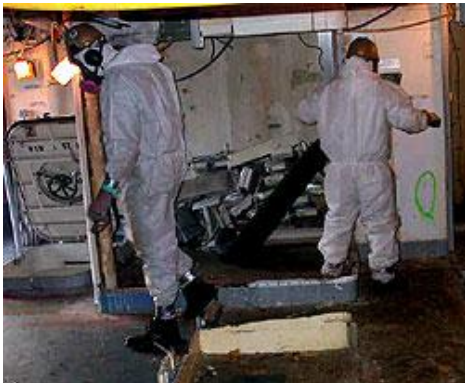
Figure 4.2 "Workers with respirators, ear muffs and other personal protective equipment (PPE)."

Some degree of protective measures will be required to protect workers, occupants and third parties. The level of personal protective equipment (PPE) required is dictated by the Occupational Safety and Health Administration (OSHA). OSHA was formed under the Occupational Safety and Health Act of 1970 to create safe working environments by making and enforcing standards and by providing training and education. 70 OSHA determines when PPE is required and to what degree based on permissible exposure limits (PEL) which is calculated based on a concentration over an 8-hour time frame. The equipment needed depends on the authorized plan, but includes chemical-resistant gloves, Tyvec coveralls, goggles, and a respirator. 71 With mechanized tools, additional respirators may be necessary because of the increased number of dust particles in the air. To protect occupants and third parties from dust particles, an enclosed containment area with plastic covering and a HEPA filter should be used to control the dust. Additional vacuum attachments can be placed on electromechanical devices.