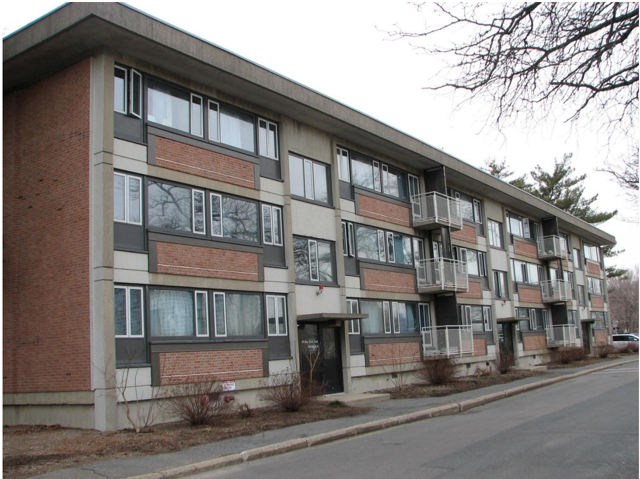
Figure 6.2.1: Westgate Low-rise, MIT, Cambridge, MA