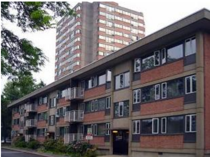
Figure 6.2.2: Westgate, Cambridge, MA