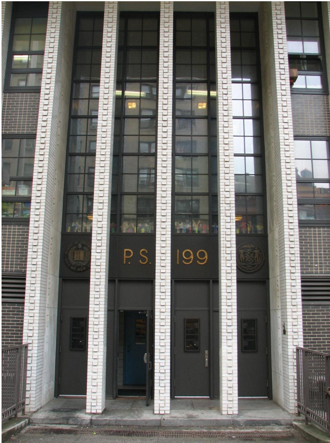
Figure 6.1.1: P.S. 199, Jessie Isador Straus School, Manhattan, NY