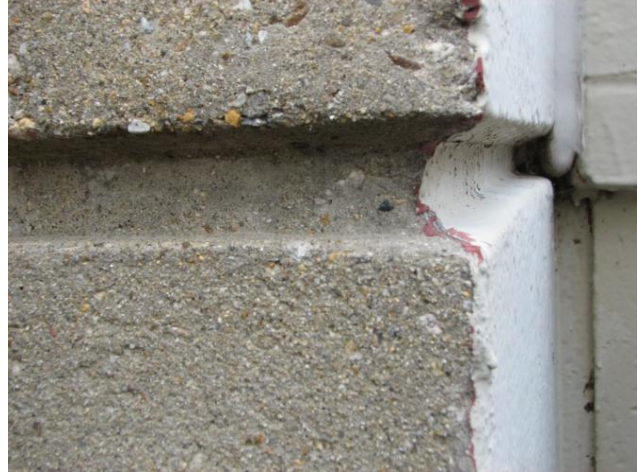
Figure 6.2.5: Westgate Encapsulation Detail Cambridge, MA Photographed by Emily Sinitski, 2013