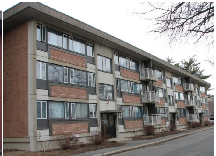
Figure 6.2.3: MIT Westgate Cambridge, MA Photographed by Emily Sinitski, 2013