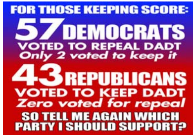
Figure 1. i