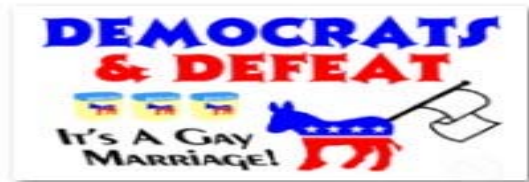
Figure 2. ii