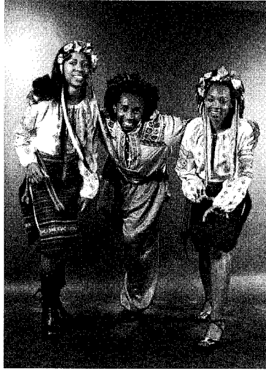
Example 1: A promotional picture for Alfa-Alfa, an Afro-Ukrainian folk fusion ensemble based in Kharkiv, Ukraine. Used with permission.

a costumed, caricatured lens through which all Others were depicted and socially categorized.