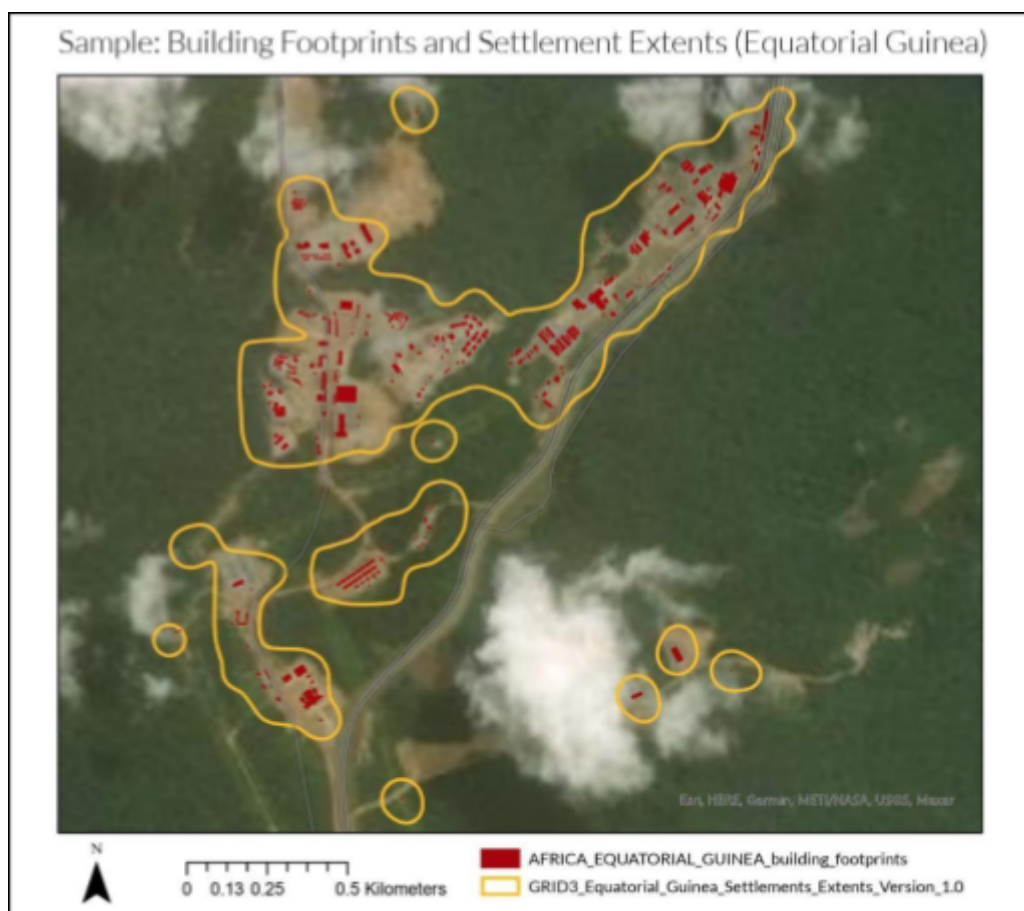
Figure 3: Sample map depicting a settlement extent data layer, with building footprint layer for reference. Note: Building footprint layers are not included in this data product.

The Population Counts / Constrained Individual countries 2020 UN adjusted (100m resolution) population estimates (Pop_UN_adj) recognises that the United Nations produce their own estimates of national population totals. WorldPop, in order to provide flexibility to users, adjusted the number of people per pixel of its top-down constrained population estimates nationally to match the corresponding official United Nations population estimates (i.e. 2019 Revision of World Population Prospects).