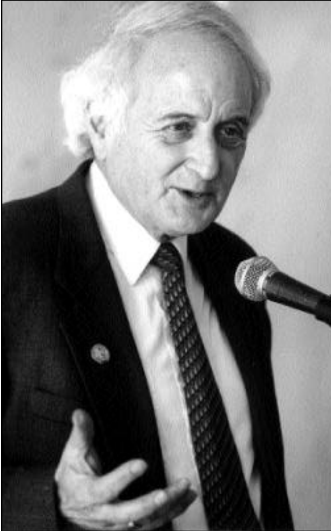
Congressman S. Levin