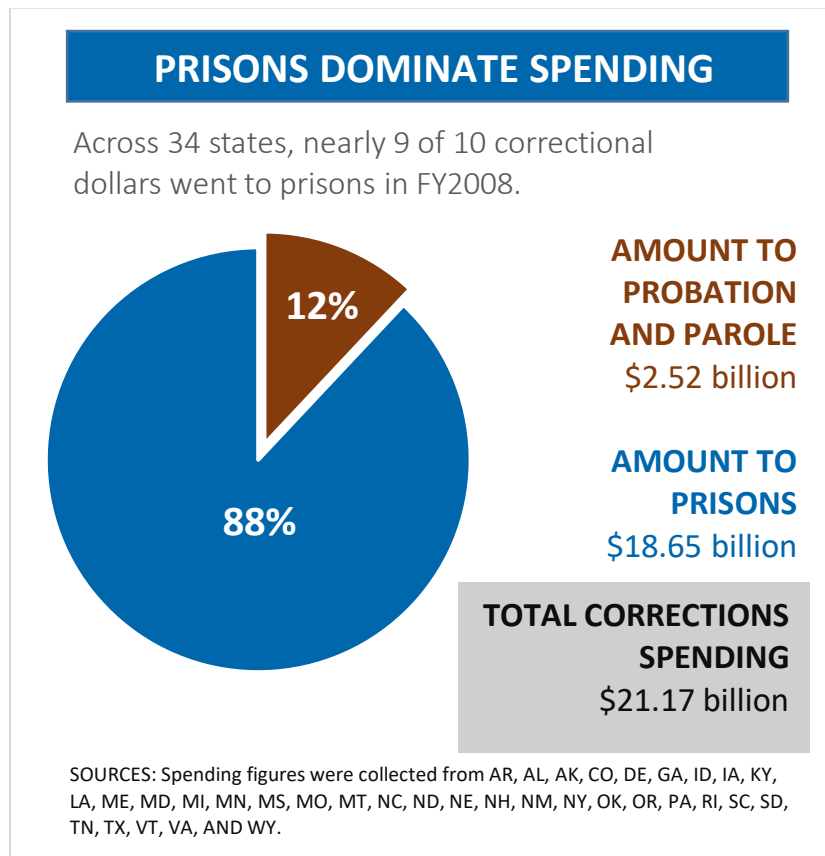
Figure 2. State Correctional Spending, FY2008